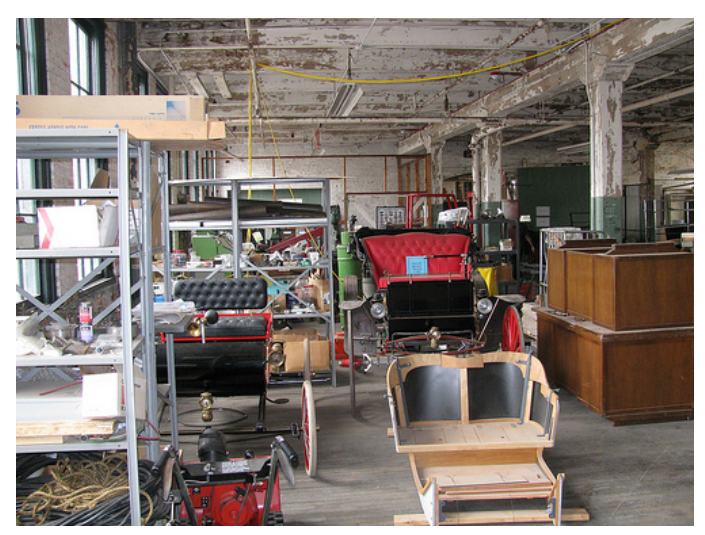
Area where the Model T's are restored.