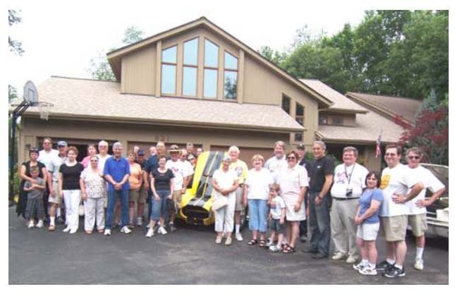
The cruisers around my favorite car in Mark Turner's collection, YELLOW Cobra.

The last stop was O'Toole's Restaurant in Waterford where everyone enjoyed their meals and an opportunity to share similar interests. We are looking forward to next year's SAAC-MCR Summer Cruise.