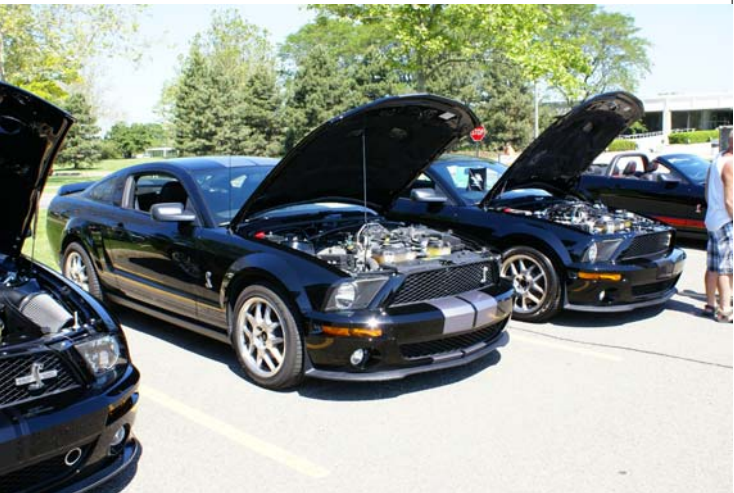
Many late model Shelby Mustangs participated in the SAAC-MCR Show 35.

The weather was perfect for the SAAC-MCR Show 35. 229 cars participated in the event. 51 First Place and 61 Class Awards were presented. Best of Show trophies were awarded in seven different categories.