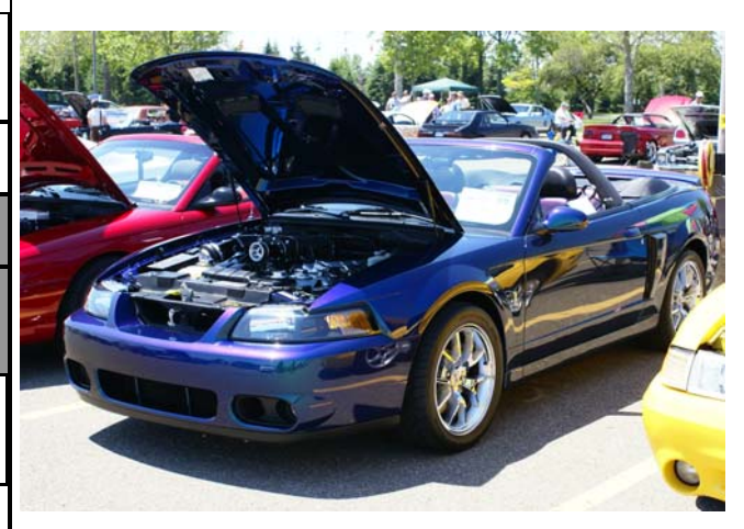
BEST OF SHOW LATE MUSTANG: Mystichrome 2004 Cobra Convertible owned by Ron Alfafara.