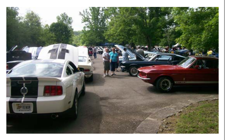
Late model and Early Model Shelby's parked near one another.