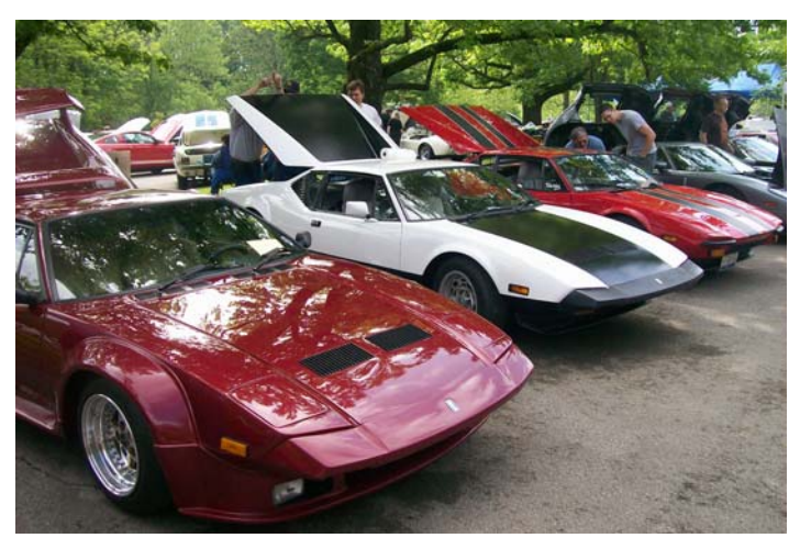
Several Pantera's participated in the Indiana Spring Fling.