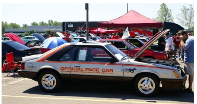
1979 Mustang Indianapolis Pace Car

1964 Fairlane Thunderbolt, created for professional race drivers whose only goal was to get to the end of a quarter-mile strip as fast as humanly possible.