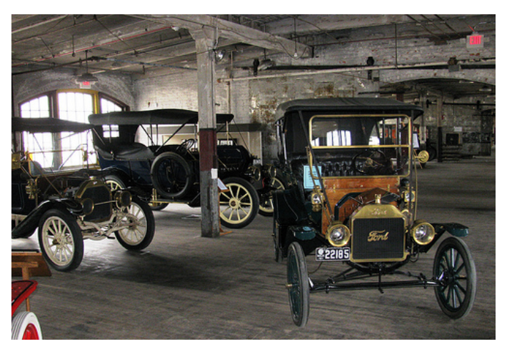
A few of the many Model T's on display at the Ford Piquette Avenue Plant.

The Ford Piquette Avenue Plant was utilized to build Model T's from 1904 to 1910.