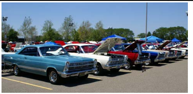
The Fairlane Club was well represented at Show 35.