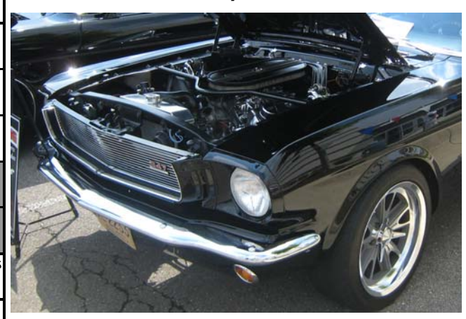
BEST OF SHOW ENGINE: 1966 Mustang restomod convertible; triple black, Livernois block 347, built A.O.D. with 3:55 limited slip differential, owned by Al Cabadas.